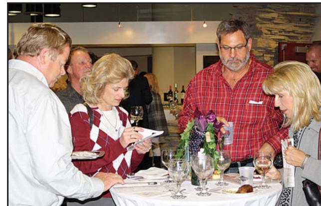
Sponsor Beverly Farm employees and guests enjoyed the fare of Grapes for Growth.